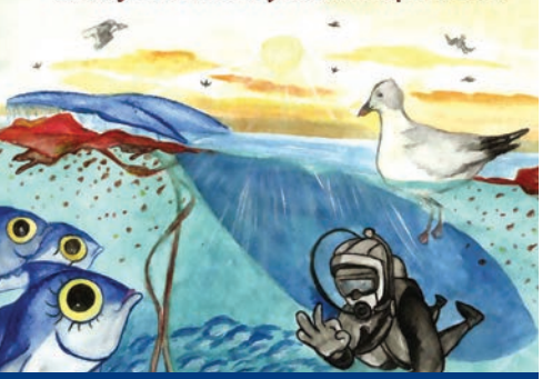
Getting the message across

El Viaje de Jurella y los Microplásticos