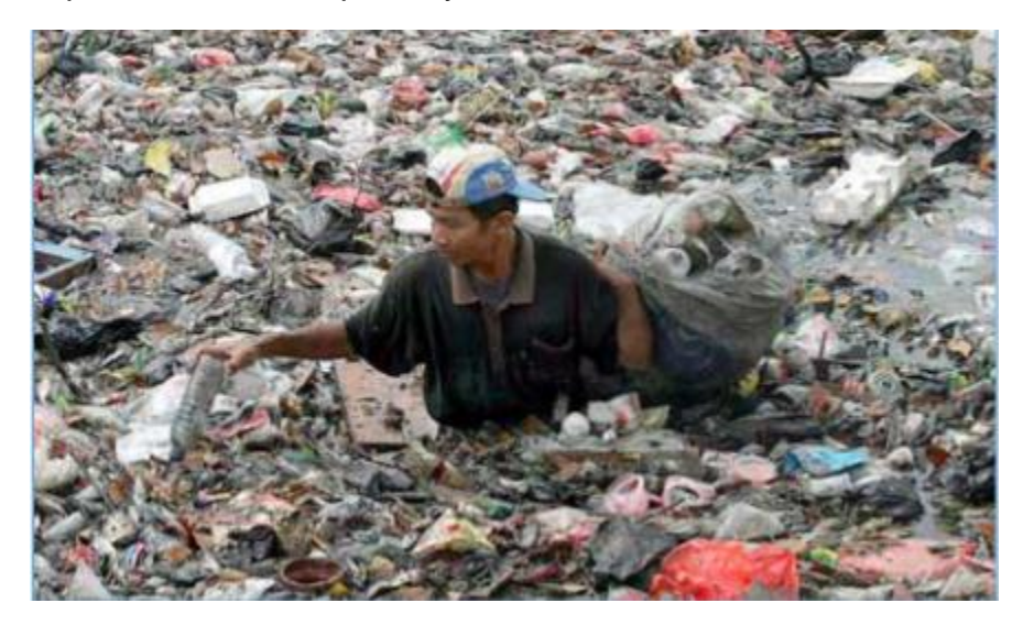
Fig 4 Scavenging ocean waste in Indonesia.

Rwanda has banned plastic bags, and they have received international praise for doing so. Despite there being severe financial penalties for giving out bags, there is a thriving black market industry around smuggling bags from neighbouring countries. Many desperately poor people who collect bags for recycling are suffering, as this is their only source of income to feed their families. The Rwandan government did not take into account the poverty of people, and lack of education therefore no understanding of the problem. Informal waste picking can have economic benefits. In Jakarta it is estimated that waste-pickers divert up to 30% of plastic waste, extending the life of landfills with an estimated yearly benefit of $50 million dollars (Medina, 2008). Supporting pickers can have social, economic and environmental benefits; for example in Brazil 60,000 pickers organised into 500 cooperatives, and earn twice the minimum wage. However, despite this the plastic waste entering rivers and oceans from such countries is staggering. Several other countries have taken steps to reduce the use of single use plastics; for example Italy and France.