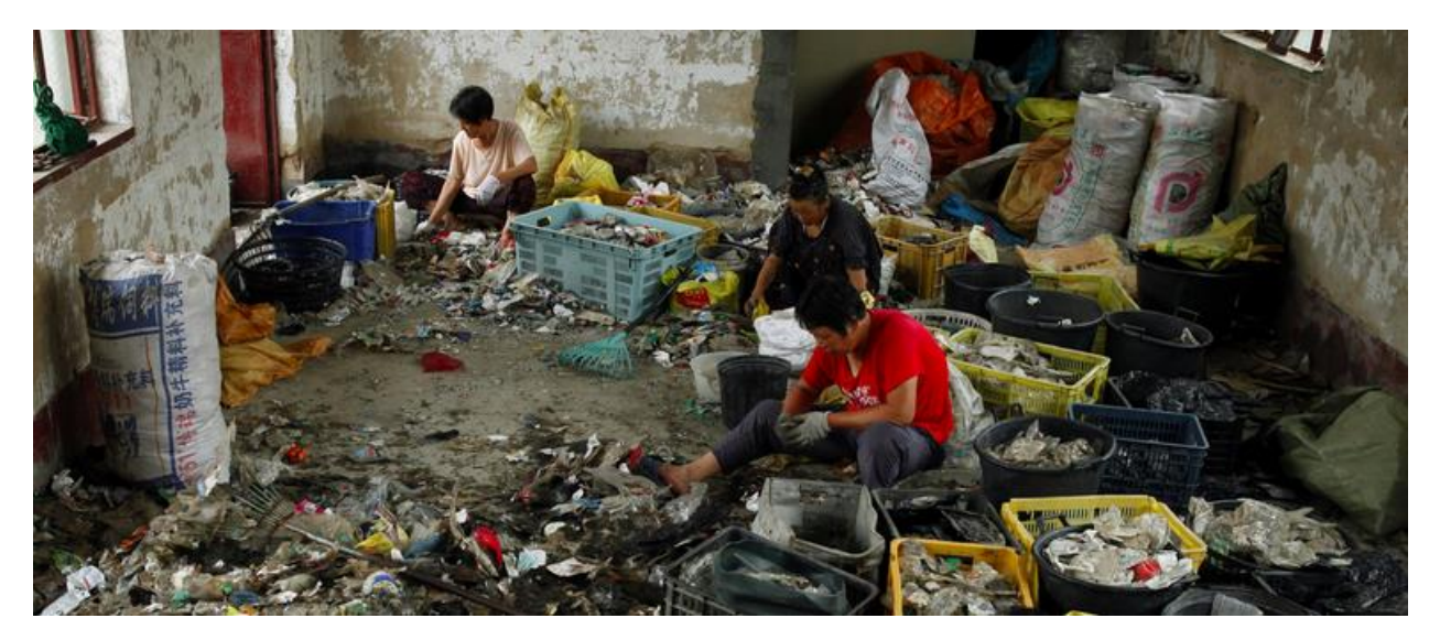
Fig 3. Family sorting through plastic waste, China. Jiu-Liang Wang Plastic China. https://www.plasticchina.org/

Many countries collect plastic bags for recycling, but after collection it can be problematic where they actually end up: in the regular waste stream, and countries such as China where child labour is used to clean, sort and prepare the plastic for reuse, causing severe health and environmental problems. (Plastic China, 2017)