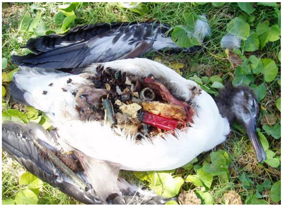
Fig 2 This Laysan albatross chick died after sharp plastic pieces punctured its digestive tract.

Plastic persists for decades in the ocean, where it fragments into microplastics that bioaccumulate in the food chains, and release toxins that can biomagnify up the food chains. Microplastics have been detected in organisms at every level in food chains. Toxins such as phthalates and BPA cause reproductive problems in humans as well as animals, and dioxins are carcinogenic. Plastics can also cause entanglement and ingestion, by marine animals and birds leading to immense suffering, death and plummeting of populations. Chris Wilcox, a research scientist with Australia's Commonwealth Scientific and Industrial Research Organization predicts plastics ingestion is increasing in seabirds, that it will reach 99% of all species by 2050, and that effective waste management can reduce this threat. (Wilcox, Chris, Erik Van Sebille, and Britta Denise Hardesty, 2015)