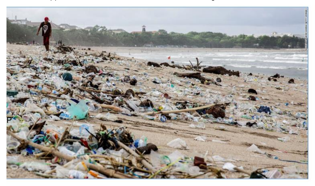
Figure 1. Ocean plastic waste in Bali, Indonesia.

Single-use plastic bags are one part of a larger group that includes items such as water bottles, straws, coffee cups, coffee pods, produce bags, detergent bottles, and many more. Packaging accounts for at least 40% of plastic use, with over 500 billion single-use bags being used every year, meaning that these types of bags have a working life of about 15 minutes. The main source of plastic bags entering the ocean is the uncontrolled dumping of plastic waste in developing countries such as Indonesia and the Philippines, where there is little or no waste management.